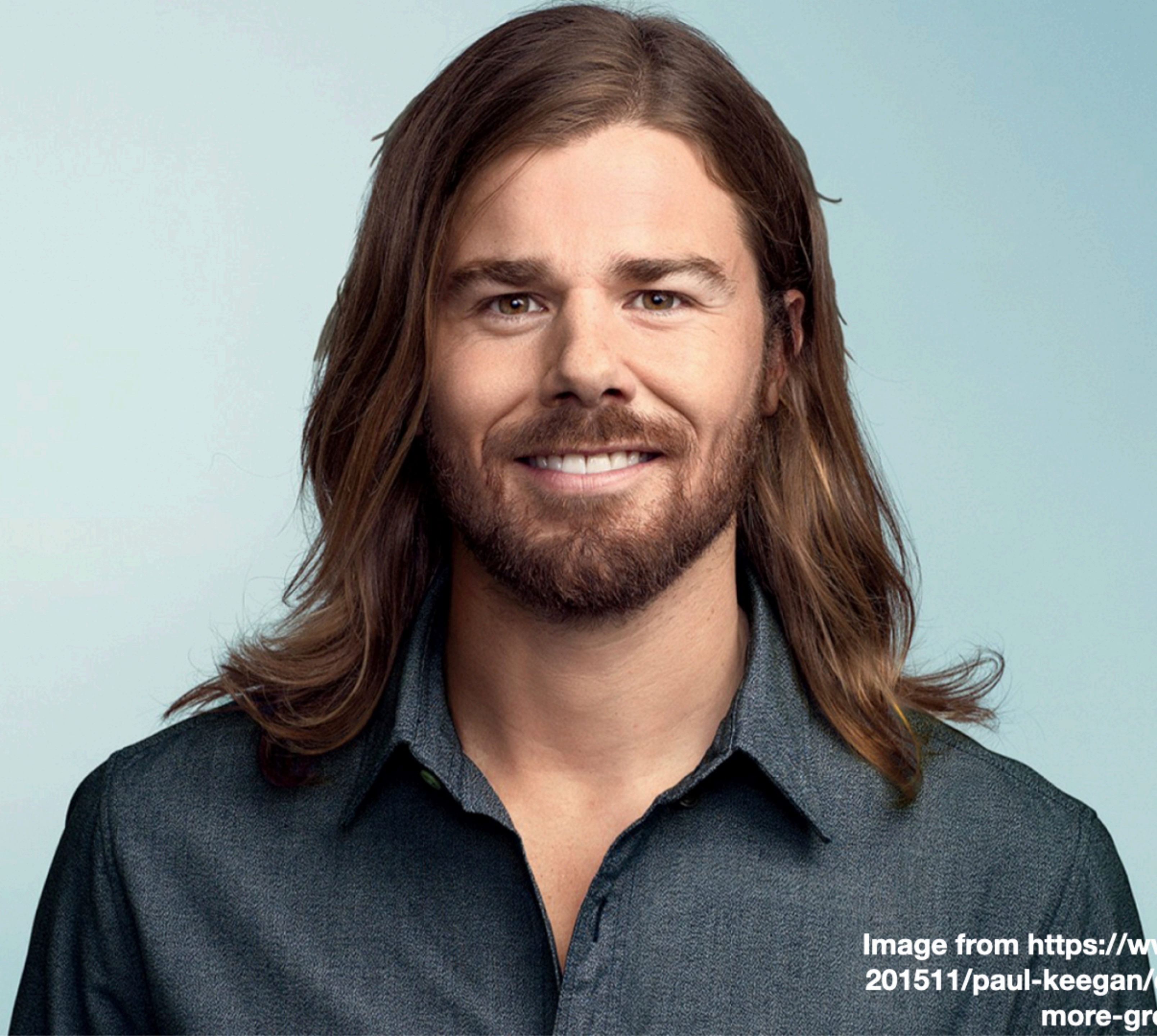
Image from https://www.inc.com/magazine/201511/paul-keegan/does-more-pay-mean-more-growth.html